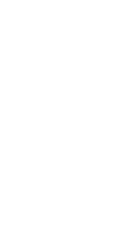
Includes Beverage (Soda, Coffee, or Tea)